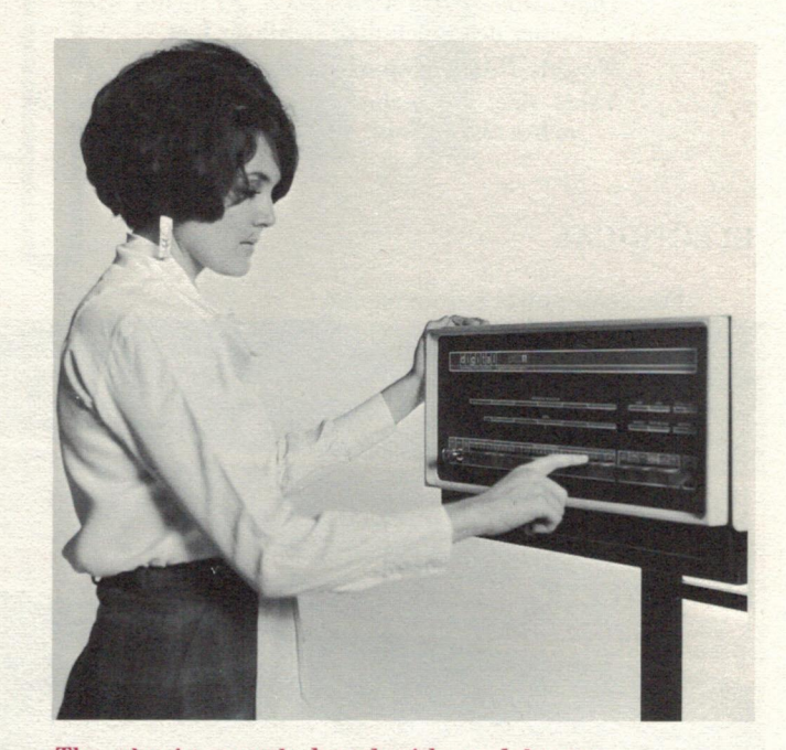
The plug-in console board with modular construction is supplied in the basic 11/20 configuration. In addition to aiding programming, console contributes to ease of maintenance on the PDP-11.

The central processor recognizes four levels of hardware interrupt. Within each major level there are sublevels. Many devices may thus be attached on each level with the device closest to the central processor given priority over the other devices on the same level. The hardware interrupt priority levels are interleaved by programmable central processor priority levels, thus allowing the running program to select the priority of allowable interrupts. Additional speed and power are added to the interrupt structure through the use of the PDP-11 fully vectored interrupt scheme. With the vectored interrupts, the device identifies itself and a unique interrupt service routine is automatically selected by the central processor without device polling. The device's interrupt priority and the service routine priority are independent. This allows dynamic adjustment of system behavior in response to real-time conditions.