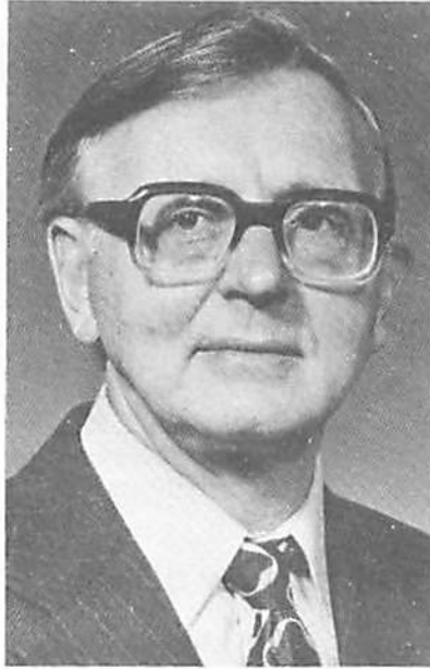
Dr. James Wilkinson

Dr. Wilkinson, a numerical analyst retired from the National Physics Laboratory, is a professor in the Department of Computer