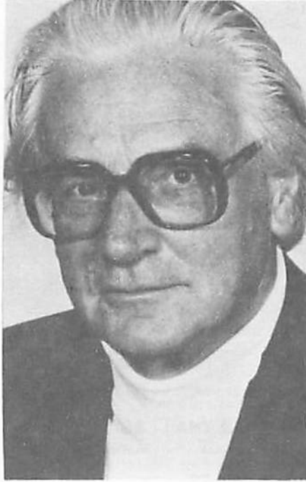
Konrad Zuse, designer of the first German computers, will be the featured speaker at the next Pioneer Computer Lecture at the Digital Computer Museum on March 4.

The Digital Computer Museum is located at One Iron Way, Marlboro, Mass. It is part of the MR complex. The museum will exhibit a number of Zuse's paintings during the month of March.