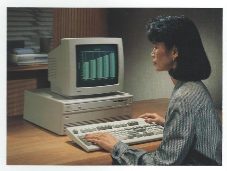
The DECstation family of powerful, industry-standard personal computers is an extension of Digital's PC integration products.

More than a PC LAN solution, PCSA offers PC users an enhanced work environment that encompasses the computing resources of the entire enterprise.