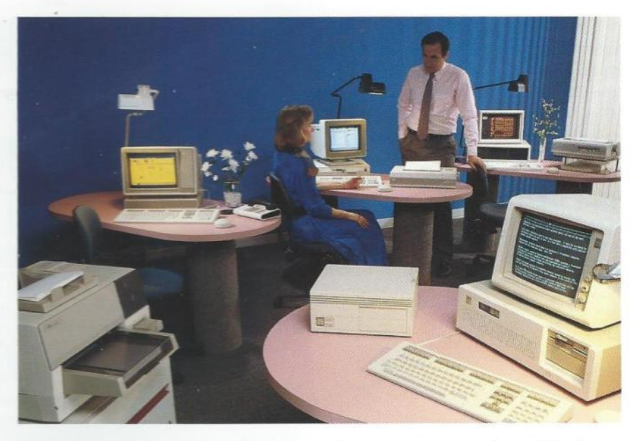
With Digital's PC integration products, you use the same DOS commands or MS-Windows interface with your networked PC as you did with your standalone PC.

Several third-party, industry-standard printer drivers are supplied with MS-Windows but are not supported by Digital.