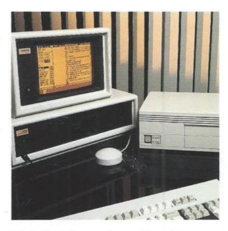
Digital's PC Integration products integrate the leading, industry-standard PC compatibles from a variety of vendors.

Digital's PCSA DECstart Service provides implementation support for installing VMS Services for PCs and DECnet PCSA Client for DOS software. In Europe, this start-up consulting service is called MS-DOS SERVERstart. Time and materials consulting is also available.