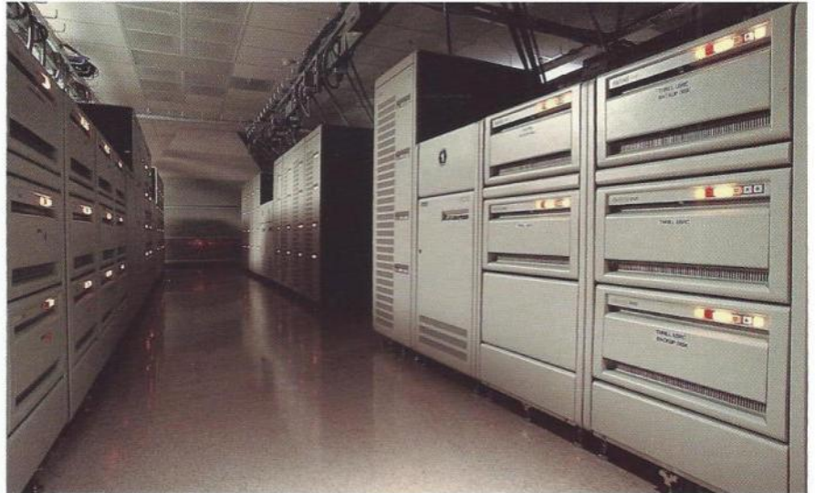
The "disk farm" at Westford. What's different here? The lights are out, yet the data center is fully functioning.

Westford Operations is responsible for the primary components of large VAX processors manufactured at plants around the United States. In addition, it has cooperative relations with groups throughout the world. Like many organizations of its kind, it has faced changes in recent years — in its case, consolidation of its 14-site operating staff into one facility in Westford, Massachusetts. In the course of the move, the following challenge was put to data center personnel — 1) build the best technical solution to meet the overall business objectives of the newly consolidated organization, 2) create a flexible working environment to suit the diverse needs of users — office automation activities, text generation, communications, and data analysis at one end,