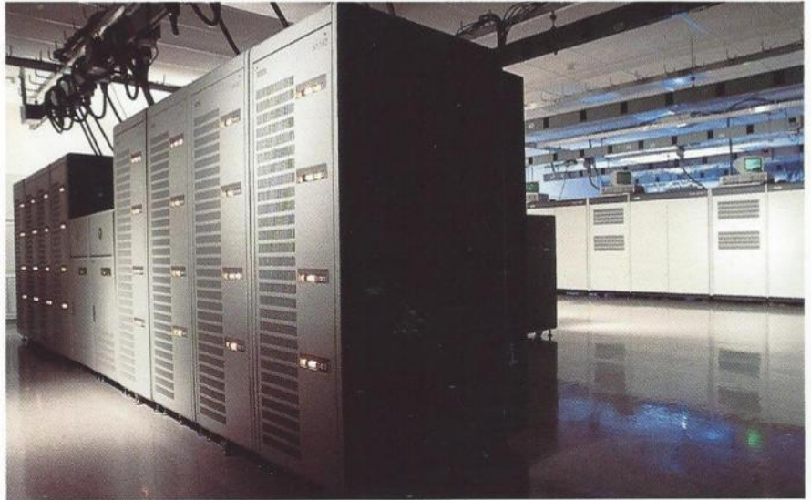
A modular approach to data center design, grouping equipment by type, makes for a more efficient and productive working environment.

Consider this: true systems' ownership costs are lifetime costs. An analyst for the Gartner Group, reviewing a number